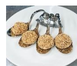
擂沙汤圆 Glutinous Rice Ball Coated With Crushed Peanuts