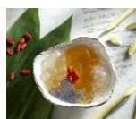
香茅雪燕芦荟冻 Lemongrass, Gum Tragacanth and Aloe Vera Jelly