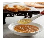
石蜂糖炖金丝燕窝 Double-boiled Golden Bird's Nest In Honey Rock Sugar