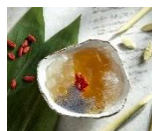
香茅雪燕芦荟冻 Lemongrass, Gum Tragacanth and Aloe Vera Jelly