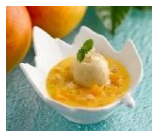
杨枝甘露香草雪糕 Chilled Mango Puree With Sago, Vanilla Ice-Cream