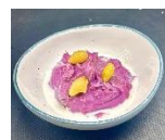
紫薯白果芋泥 Yam And Sweet Potato Paste With Coconut Puree Topped With Ginkgo Nuts