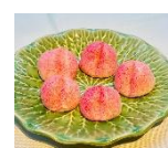
寿桃 Longevity Buns