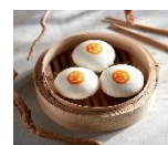
金浆玉液流沙包 Steamed Custard Buns With Salted Egg Yolk