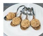
擂沙汤圆 Glutinous Rice Ball Coated With Crushed Peanuts