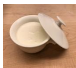
现磨杏仁茶 Double-boiled Fresh Almond Puree