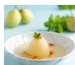
冻柚子汁雪燕津梨 Chilled Tianjin Pear With Honey Pomelo Citrus