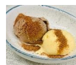
自制雪糕 (香草) Homemade Ice Cream Double Scoop (Vanilla)