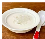
官燕炖杏仁茶 Double-boiled Superior Bird's Nest With Almond Puree