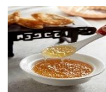
石蜂糖炖金丝燕窝 Double-boiled Golden Bird's Nest In Honey Rock Sugar