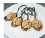
擂沙汤圆 Glutinous Rice Ball Coated With Crushed Peanuts