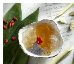
香茅雪燕芦荟冻 Lemongrass, Gum Tragacanth and Aloe Vera Jelly