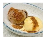
自制雪糕（香草 | 美禄） Homemade Ice Cream Double Scoop (Vanilla | Milo)