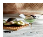
红豆牛油果香草雪糕 Chilled Avocado Puree With Vanilla Ice-Cream And Red Bean