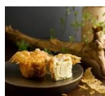
枫糖冰火榴莲 Crispy King Of Durian Ice Cream With Maple Syrup