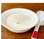
官燕炖杏仁茶 Double-boiled Superior Bird's Nest With Almond Puree