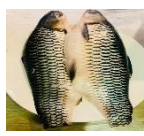
黑美人忘不了 (预定)

Sarawak Black Empurau Fish (3-4kg) (placed your order in advance)