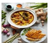
甘榜滑鸡配砂煲黄姜饭 (需 45 分钟时间制作) Claypot Rice With Kampong Chicken And Yellow Ginger (45mins waiting time)