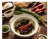
砂煲腊味饭 (需 45 分钟时间制作) Claypot Rice With Preserved Meat (45mins waiting time)