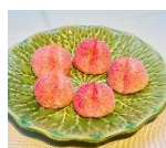
寿桃 Longevity Buns