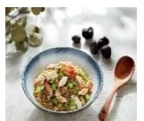
黑松露蟹肉蛋白炒饭 Signature Crabmeat Fried Rice With Egg White And Black Truffle