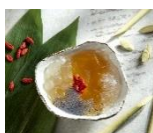
香茅雪燕芦荟冻 Lemongrass, Gum Tragacanth and Aloe Vera Jelly