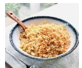
飞鱼籽带子粒炒饭 Ebiko Fried Rice With Diced Scallops