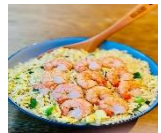
虾仁蛋炒饭 Fried Rice With Prawns And Egg