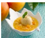
杨枝甘露香草雪糕 Chilled Mango Puree With Sago, Vanilla Ice-Cream