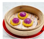
紫薯奶皇水晶包 Steamed Crystal Ball With Custard And Sweet Potato