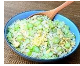
净菜粒炒饭 Fried Rice With Diced Vegetable