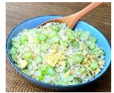
鸡蛋菜粒炒饭 Fried Rice With Eggs And Vegetable