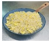
净鸡蛋炒饭 Fried Rice With Eggs