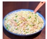
咸鱼鸡粒银芽蛋炒饭 Fried Rice With Salted Fish, Chicken And Bean Sprouts