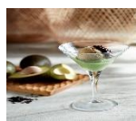
红豆牛油果香草雪糕 Chilled Avocado Puree With Vanilla Ice-Cream And Red Bean