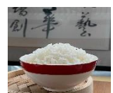
白饭 Steam Rice