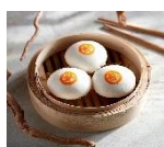
金浆玉液流沙包 Steamed Custard Buns With Salted Egg Yolk