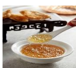
石蜂糖炖金丝燕窝 Double-boiled Golden Bird's Nest In Honey Rock Sugar