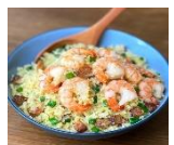
扬州叉烧虾炒饭 Yang Zhou Fried Rice With BBQ Pork And Shrimps