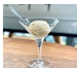
香草雪糕 Vanilla Ice-Cream Single Scoop